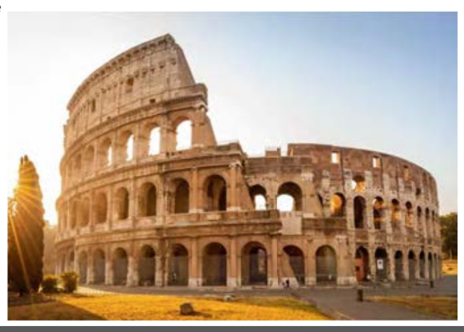
Day 2: Thursday June 3, 2021